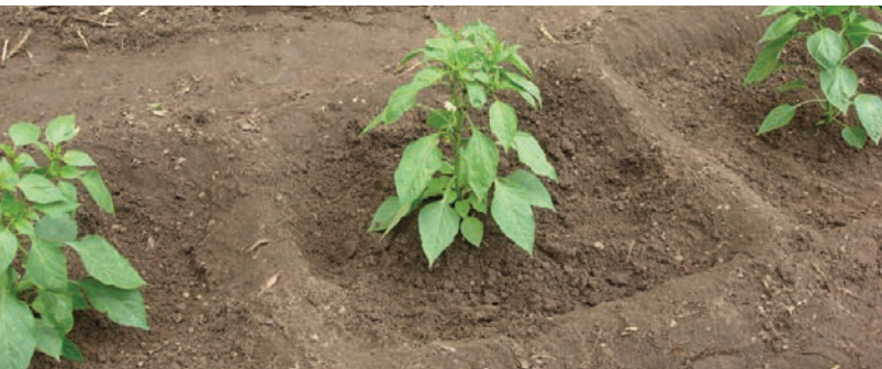
Green chile plants in waffle garden at NMAI.