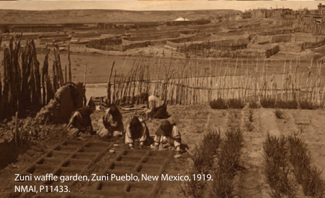
Zuni waffle garden, Zuni Pueblo, New Mexico, 1919. NMAI, P11433.