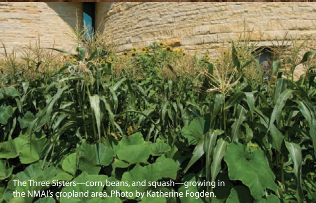
The Three Sisters—corn, beans, and squash—growing in the NMAI's cropland area.