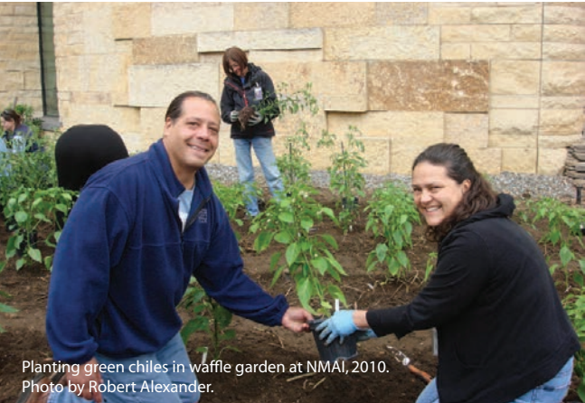
Planting green chiles in waffle garden at NMAI, 2010.