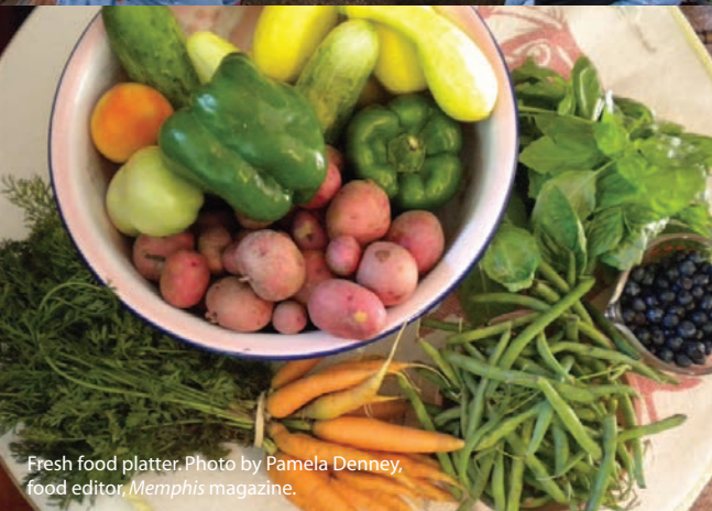
Fresh food platter.